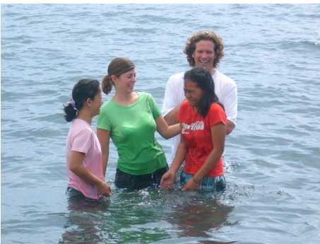
(Continued from page 1)