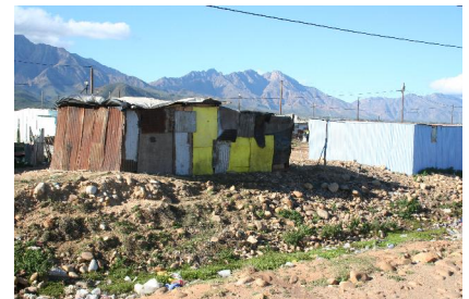
The shacks of a township in South Africa